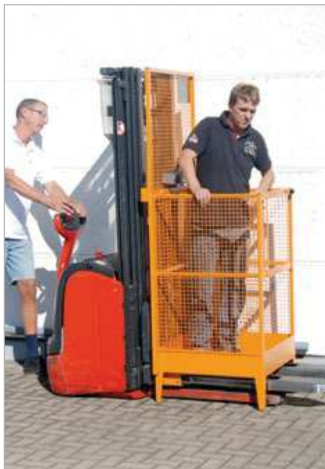
Type MB-I with straddle stacker