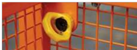
Anchorage point for protective equipment