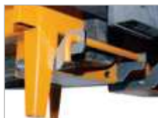
Secured by bolt to prevent slipping from the forklift truck