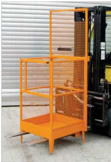
Type MB-I chain security with forklift truck